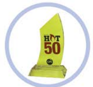
HOT 50 Best Security Integrator