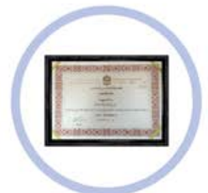
UAE National Bureau of Statistics 2013-2011