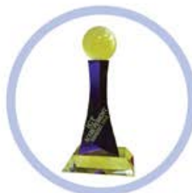
ICT ACHIEVEMENT AWARDS 2014