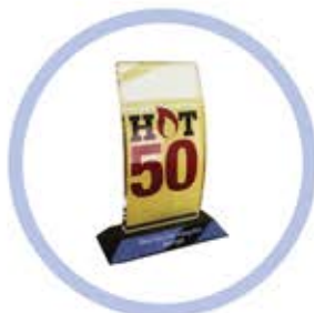
HOT 50 Best Security Integrator