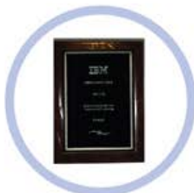
IBM ASL Security Awards 2015